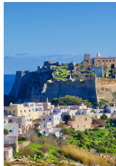
Chora – Kythera town

Today, Chora feels more like a lived-in historic quarter than a resort: small churches, courtyards, and neoclassical-influenced houses sit beside cafés and local shops. The nearby harbor area of Kapsali functions as Chora's seaside "front porch," linking the capital's cultural character with swimming spots and waterfront dining.